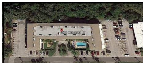
ROOF COVER FLAT/GABLE