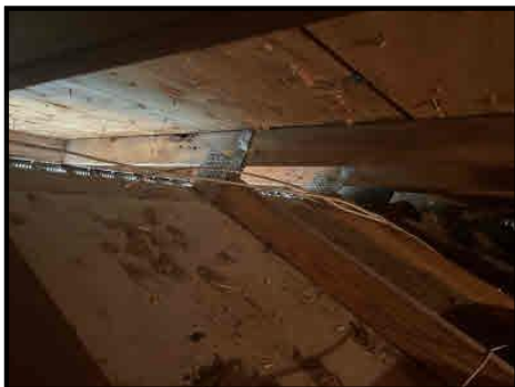
SINGLE WRAP BACK