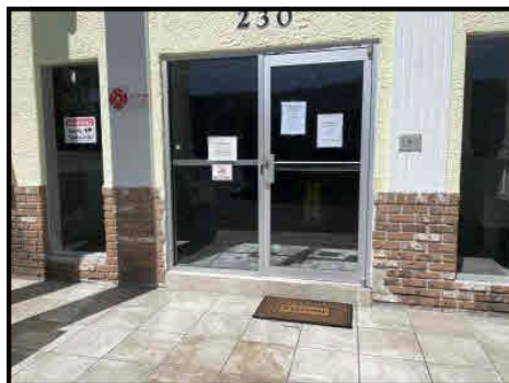
NON IMPACT GLAZED