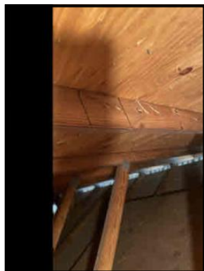
6"/6" NAIL SPACING