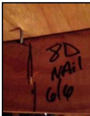
8D NAILS 6"/6"